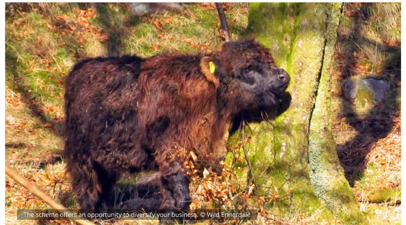
The scheme offers an opportunity to diversify your business.

www.gov.uk/guidance/create-woodland-overview