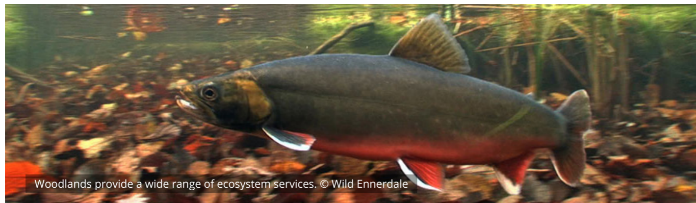
Woodlands provide a wide range of ecosystem services.

These woodlands will be places for people of all ages to enjoy and explore. Every new woodland will have public access, providing health and wellbeing opportunities to communities.