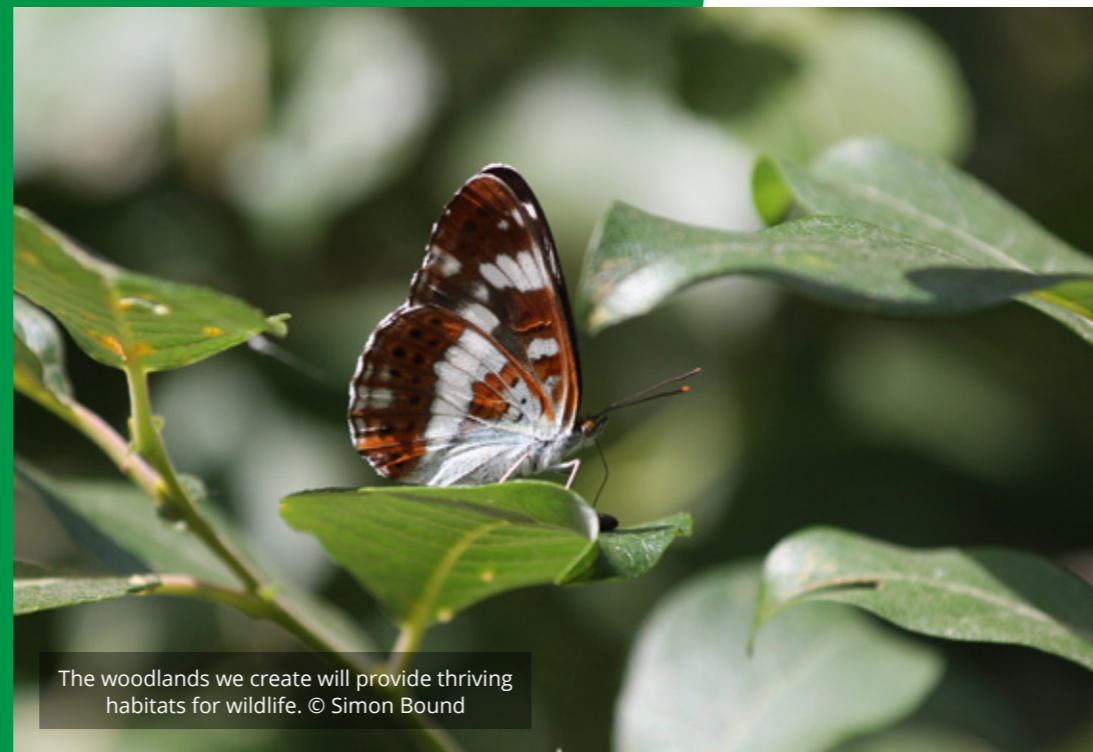
The woodlands we create will provide thriving habitats for wildlife.

If you're a new or established landowner, a farmer, a public body or a land agent acting on behalf of landowners, with a minimum of 50 hectares of land suitable for woodland creation, this scheme offers an opportunity to diversify your business and bring significant environmental and community benefits.